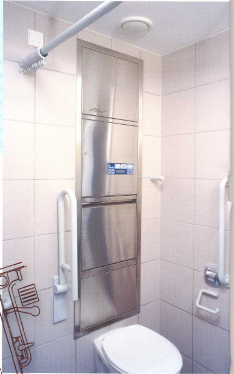
| Equipment ready for operation in the Diakoniekrankenhaus (Deaconry Hospital), Stuttgart.

There is an increasing use of complete sanitary cells in the design and construction of new hospitals and care homes. Here too MEIKO provides optimal customised solutions for the integration of bedpan washer / disinfectors into sanitary cells.