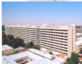
| College of Medicine Hannover, Germany