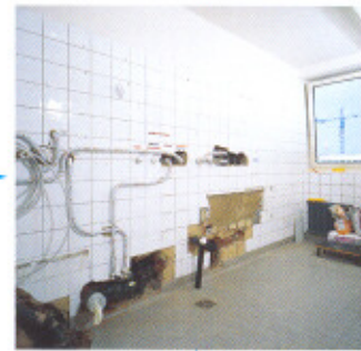
| New equipment and pipework.