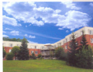
| Centre d'hébergement, St. Jean Eudes, Canada