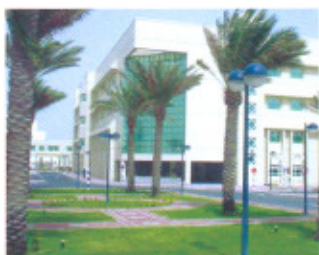
| Al Ahli Hospital, Qatar