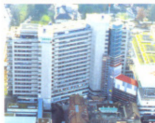
| Inselspital Zürich, Switzerland