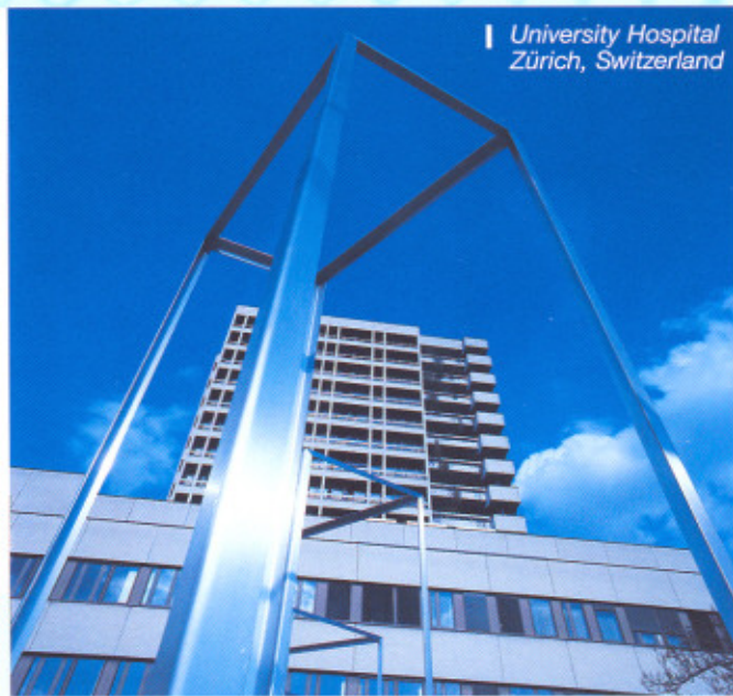
| University Hospital Zürich, Switzerland

version of the equipment. Existing equipment which has been updated must be notified to the competent authority as if it were new and its compliance confirmed. In addition, the operator is subject to the Operators Regulations and is liable for the proper registration and use of the modified appliance.