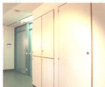
The MEIKO solution. The service doors in the corridor enable maintenance work to be carried out without disturbing the patient.