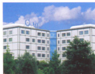
| UMC Utrecht, Netherlands

Appliances for cleaning bed-pans are subject to the conditions imposed by the European Medical Device Directory 93/42/EEC. These up-to-the-minute statutory requirements impact significantly on the design of renovation work.