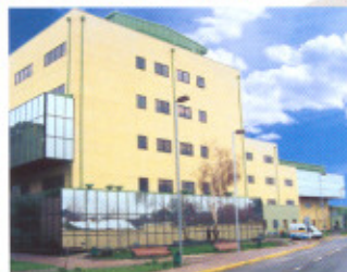
| Hospital de los Angeles, Chile