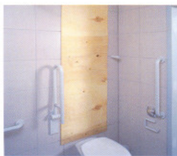
Internal view of the sanitary cell as delivered to site. The installation frame for the bed-pan washer/disinfector is behind the covering which protects the equipment during transit.

It soon becomes evident that MEIKO is more than a manufacturer of modern cleaning and disinfection appliances - MEIKO is your skilled, flexible and reliable partner in all phases of construction, from planning through to hand-over.