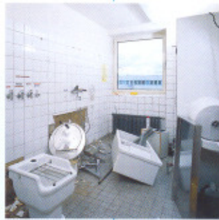
| Dismantling and removal.