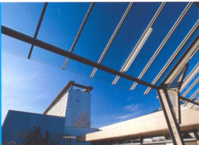
| Grosshadern Clinic, Munich, Germany