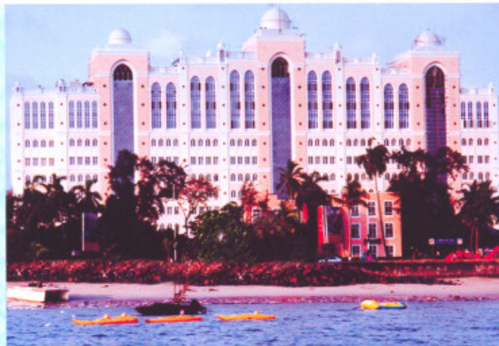
| Saifee Hospital, Mumbai, India

The proven reliability of MEIKO bed-pan washer/disinfectors, the intensive research and dynamic product development which have gone into their design make MEIKO the first choice in cleaning and disinfection equipment.