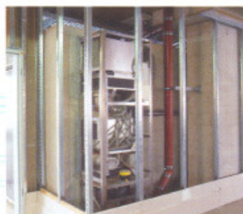
Installation of the complete appliance and closing the external walls.