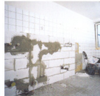
| Installation of dry walling and tiling.

An intelligent MEIKO solution, stainless steel instead of tiles, supports you in simple renovation projects. The MEIKO rear wall with integral supply and waste pipes allows all the existing supply and waste pipes in the room to be used.