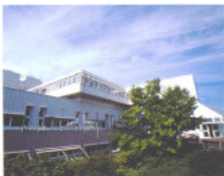
| Heidelberg Hospital, Germany

Technical specifications and performance specifications are not everything. Ergonomic design, perfect workmanship and high-end electronics are natural product features for us. But that is still not enough. We consider that an ultra-modern product is only complete if advice, planning consultancy and service go hand in hand with technical advances and engineering skills. Only then will be put our name to the MEIKO brand, allow our hygiene systems to be placed under the magnifying glass and point with pride to our references.