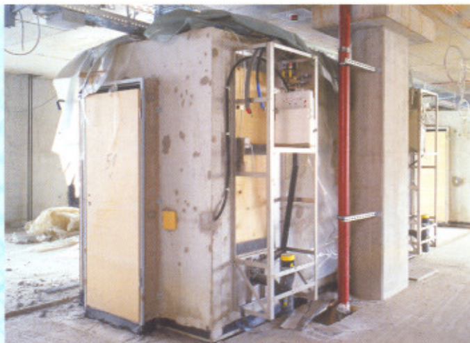
Wet cell module with integral main frame.

the appliance frames are anchored in the sanitary cells in the early construction phase; even at this stage all the necessary connections for equipment installation at a later stage are in place. The bedpan washer is installed into its frame shortly before the completion of the building and is ready for operation immediately after its quick and easy installation. This procedure protects against contamination and damage during the construction of the building shell.