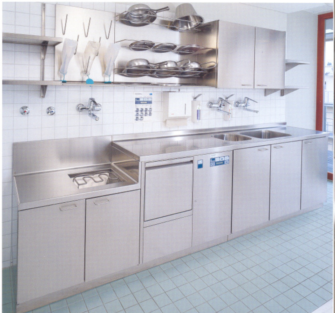
Contaminated work-room after renovation.